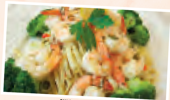
SHRIMP & BROCCOLI

Sautéed with Fresh Sliced Mushrooms in a Sweet Marsala Wine Sauce