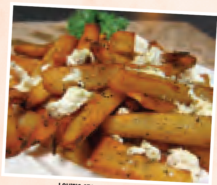
LOUIE'S SEASONED GREEK FRIES