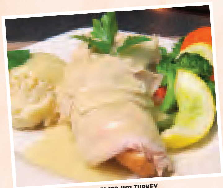
OPEN FACED HOT TURKEY

Crispy Bacon, Lettuce, Sliced Tomatoes and Mayo served on Your Choice of Toast