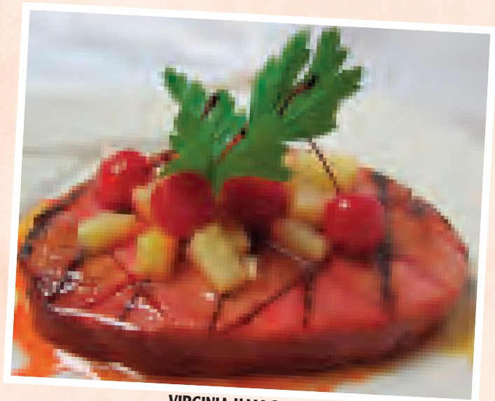
VIRGINIA HAM STEAK

Sautéed Medallions of Tender Veal with Fresh Sliced Mushrooms & Capers in a White Wine, Butter, Lemon Piccante Sauce