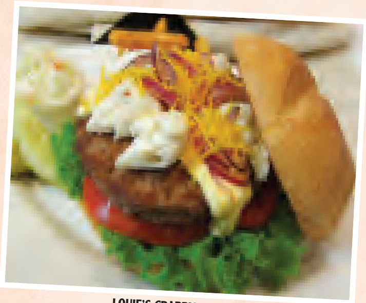
LOUIE'S CRABBY BURGER

All of Our Burgers are 8 oz. Certified Black Angus