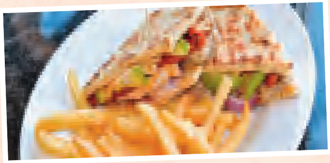
CHICKEN AVOCADO PANINI