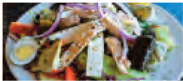
GREEK SALAD WITH GRILLED CHICKEN

ALL SALADS ARE SERVED WITH YOUR CHOICE OF DRESSING AND BREAD BASKET