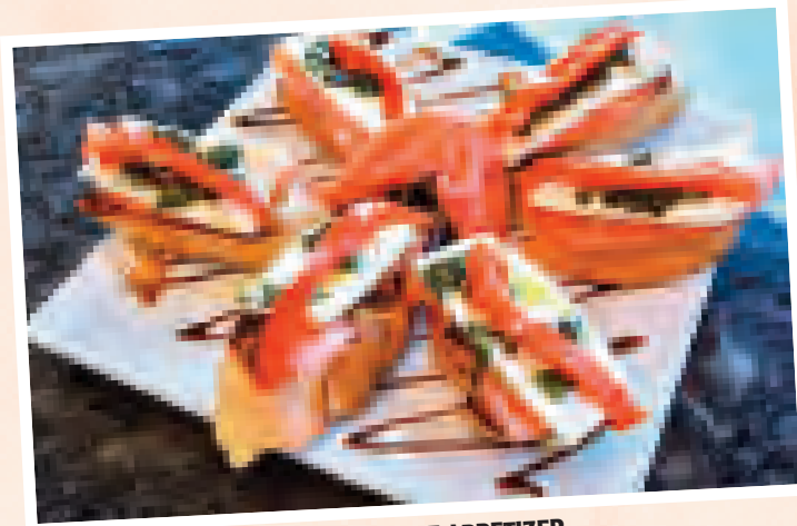
SICILIAN STYLE APPETIZER

Fresh Sliced Mozzarella Cheese, Fresh Basil, Tomatoes & Fire Roasted Red Peppers on Toasted Sliced Italian Bread topped with Virgin Olive Oil