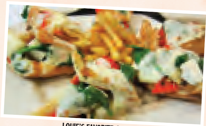
LOUIE'S FAVORITE GRINDER

Char-Broiled, Cooked to Preferred Temperature with Grilled Portobello Mushrooms, Sweet Peppers, Red Onions & Melted Provolone Cheese, toasted under Open Flame