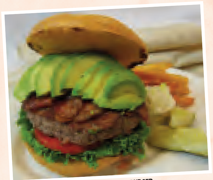
SUNSET BOULEVARD BURGER

Smoked Bacon, Piled High Onion Rings, Sliced Tomatoes, Green Leaf Lettuce, and Melted Cheddar Cheese, lightly drizzled with Country Ranch Dressing, served on a Jumbo Kaiser Roll