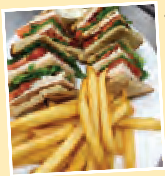
TURKEY BACON CLUB